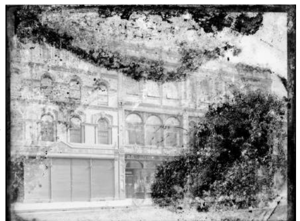
The Vienna Cafe