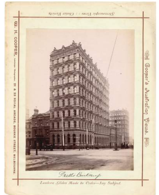
Prell's Building - the society's first home

There are five other sets of initials on the sheet, shown above.